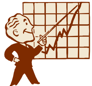
Student credit hour increase of 550% in six years

Tinker's enrollment continues to climb. For the year 2004, there are 233 active students, compared to 211 in 2003. The number of graduates also continues to climb, with 28 students completing bachelors degrees, and 69 students completing masters degrees during the 2003-2004 academic year.